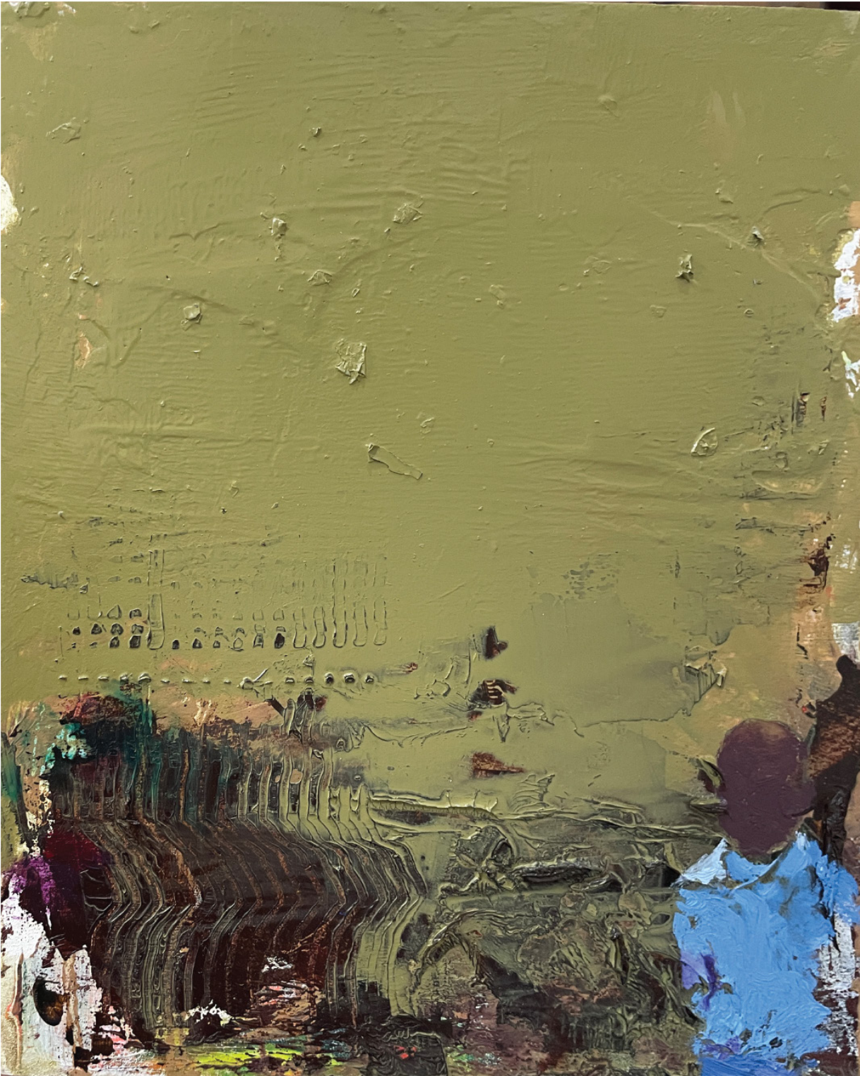
Atonement , 2022