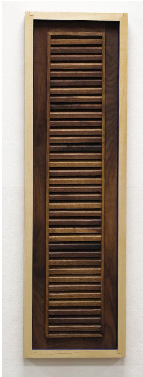
Window II , 2022 spray paint on wood 14 x 42 NFS