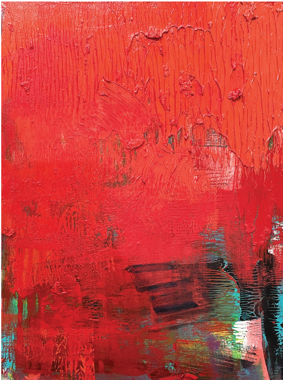
Fever dreams; Echoes in the dark , 2022