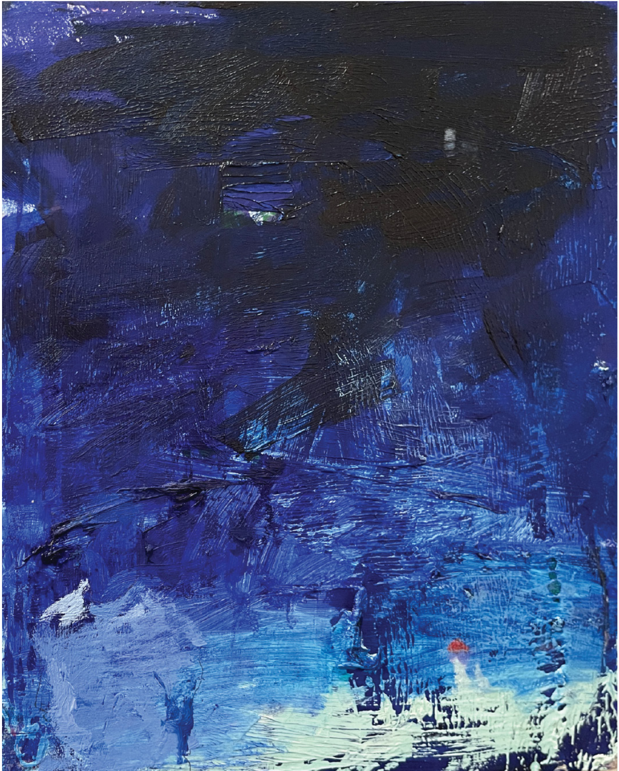
Fever dreams; last bell , 2022