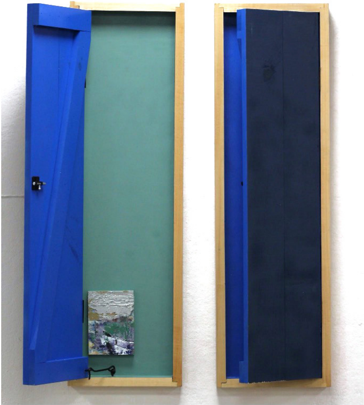
Window I , 2022 oil, spray paint, hardware on wood 14 x 42 (each panel) NFS