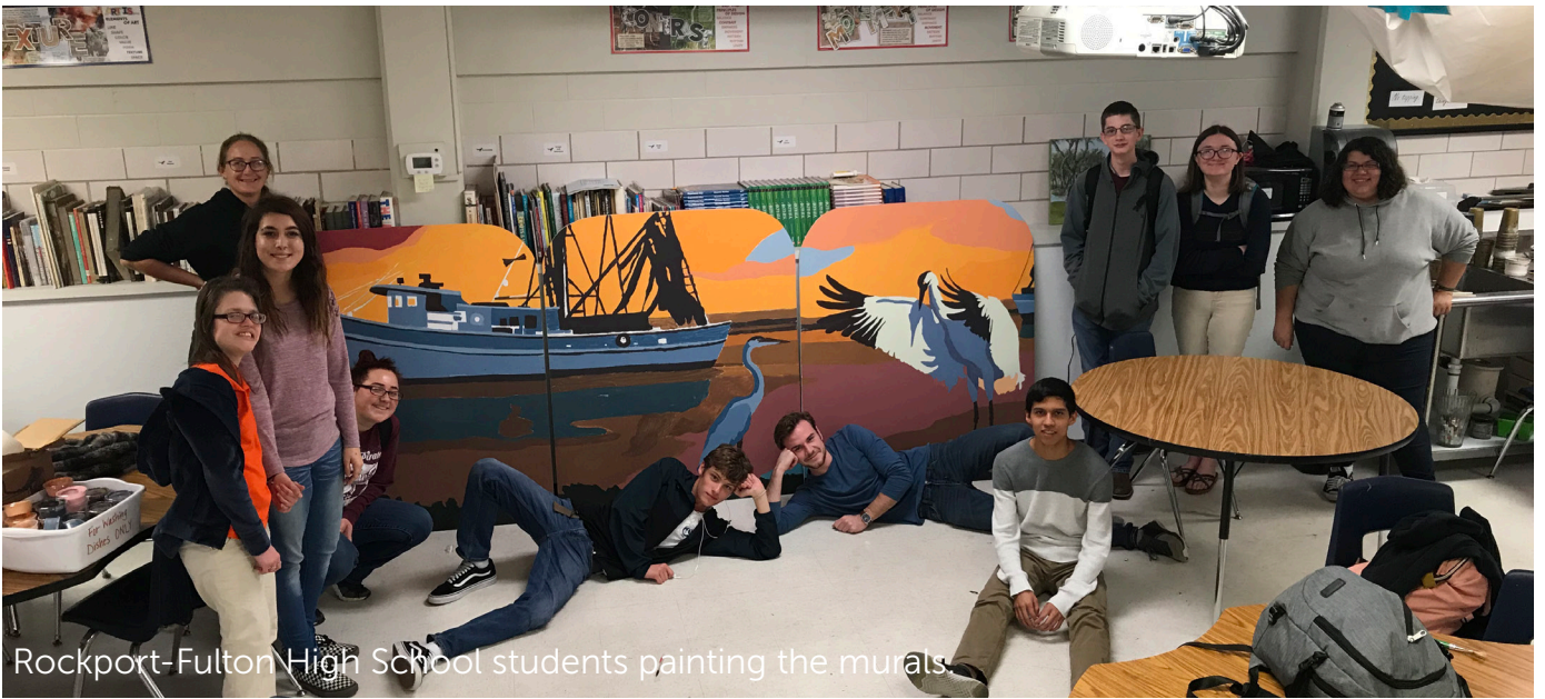
Rockport-Fulton High School students painting the murals.