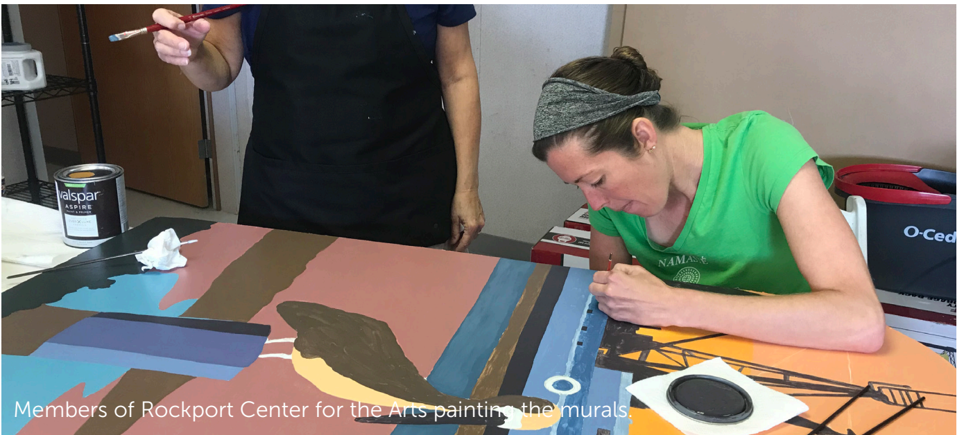
Members of Rockport Center for the Arts painting the murals.