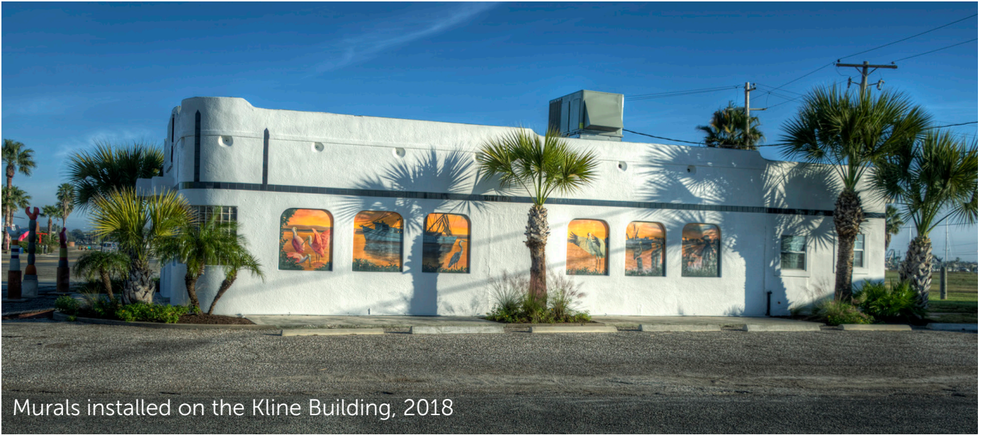
Murals installed on the Kline Building, 2018