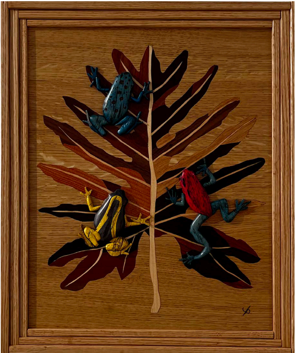
Jim Blaylock Poison Dart Frogs Wood 15 x 21 $625