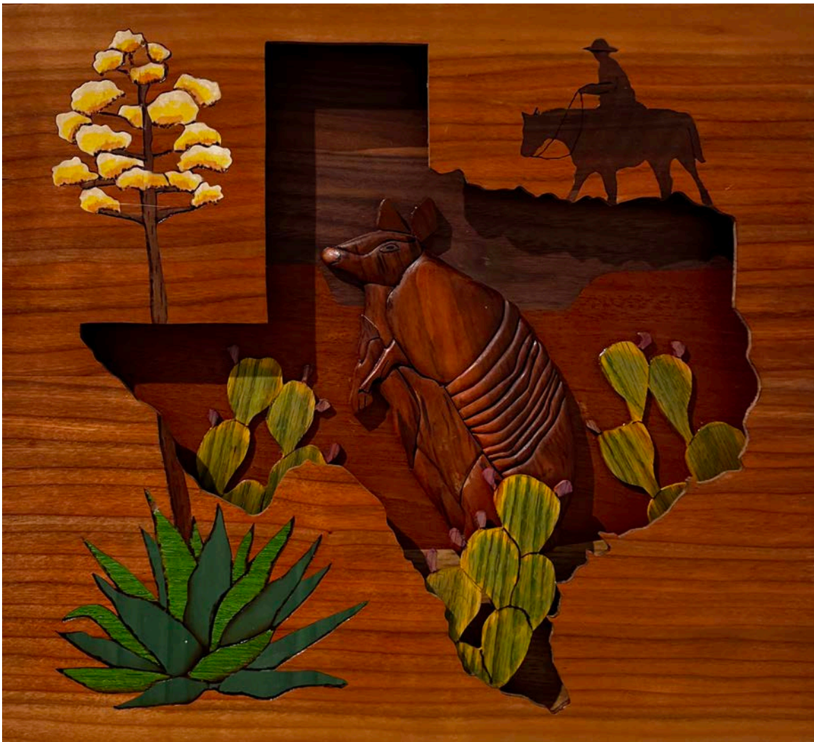
Jim Blaylock Texas Armadillo Wood 15.5 x 15 $525 SOLD