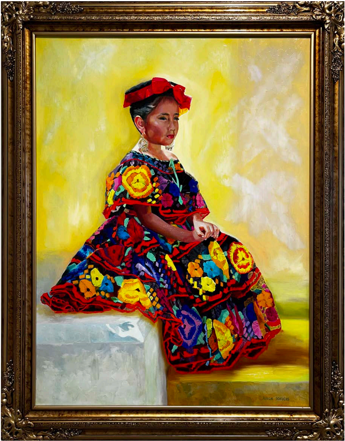
Alison Schuchs Esperando La Nina Oil on Panel 30 x 40 $3,600