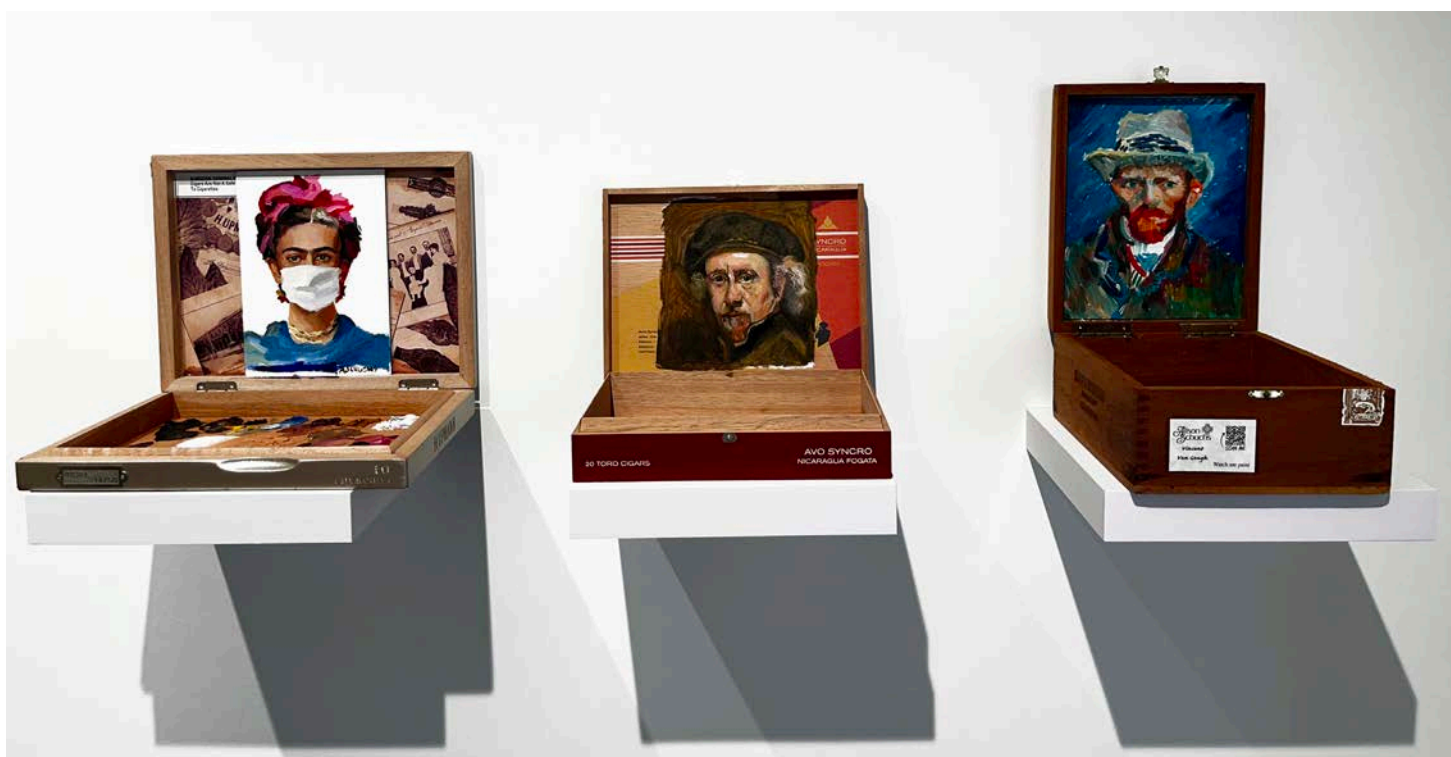
Alison Schuchs Frida 2020 Cigar Box Art 11.25 x 8.5 $250