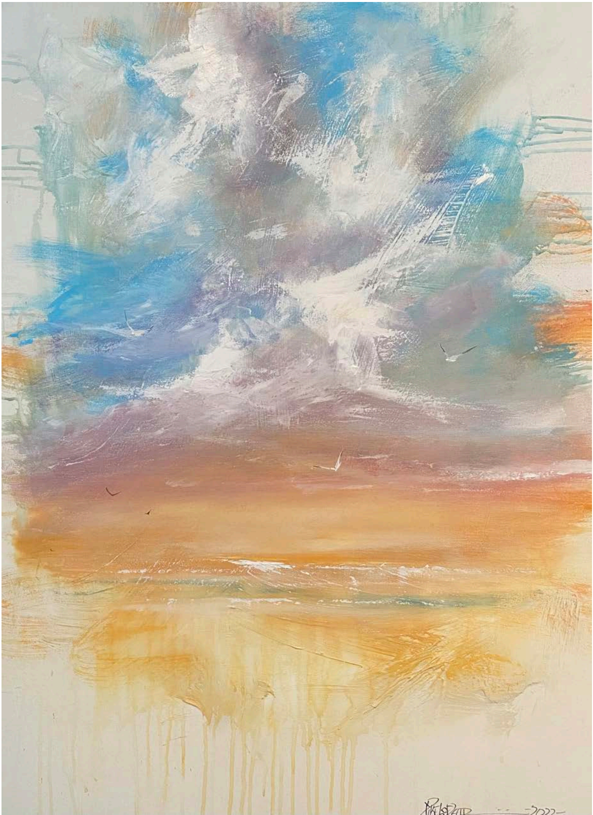
Calm Colors 30"w x 40"h mixed media on canvas $650