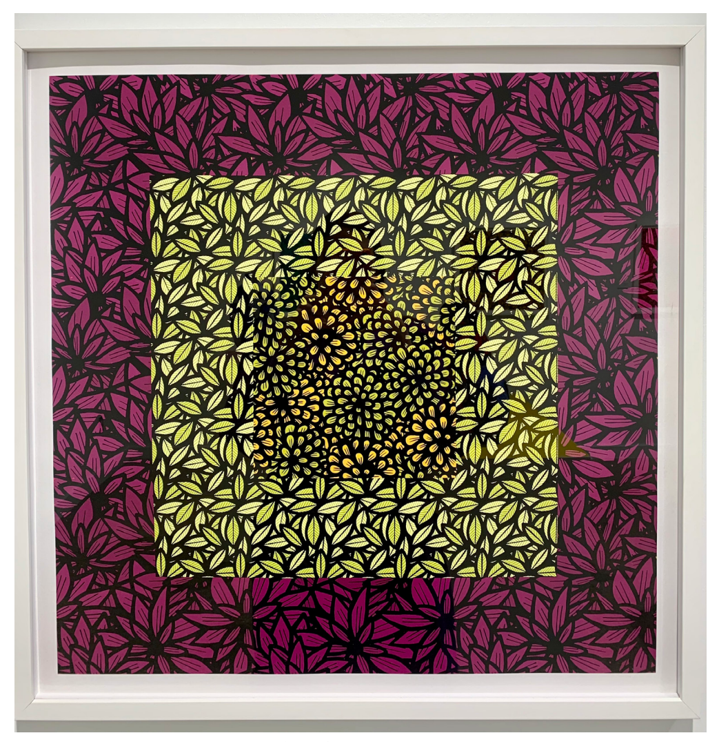
FLAG NO. 7, 2022 ARCHIVAL PIGMENT PRINT 26 X 26