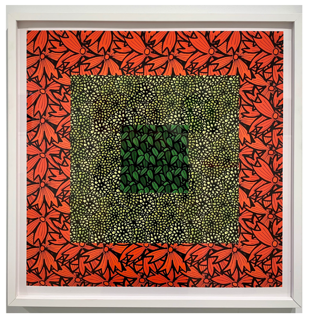
FLAG NO. 3, 2022 ARCHIVAL PIGMENT PRINT 26 X 26