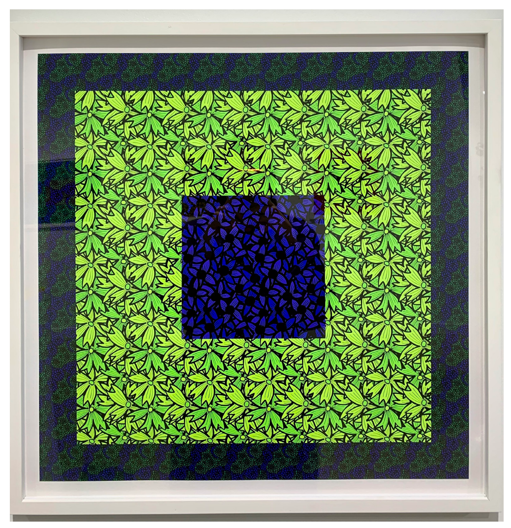
FLAG NO. 9, 2022 ARCHIVAL PIGMENT PRINT 26 X 26