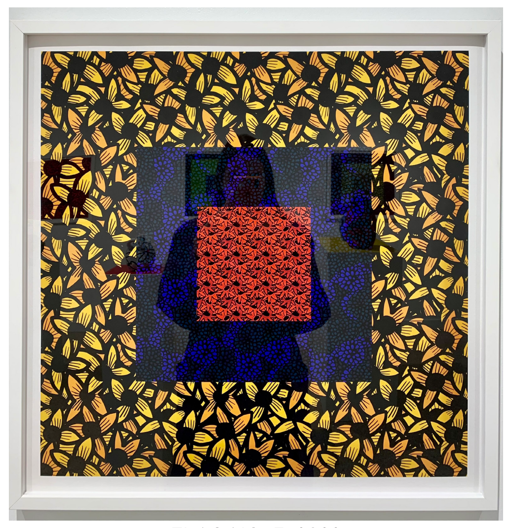
FLAG NO. 5, 2022 ARCHIVAL PIGMENT PRINT 26 X 26