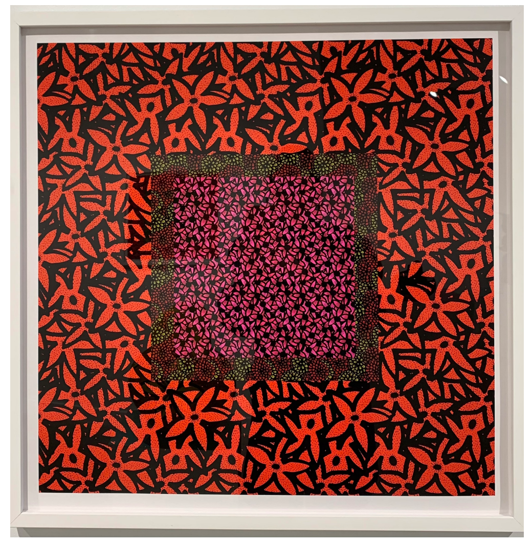
FLAG NO. 1, 2022 ARCHIVAL PIGMENT PRINT 26 X 26