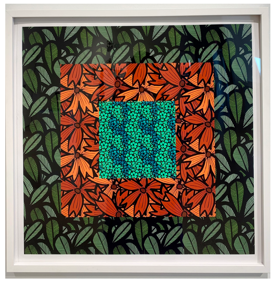
FLAG NO. 8, 2022 ARCHIVAL PIGMENT PRINT 26 X 26