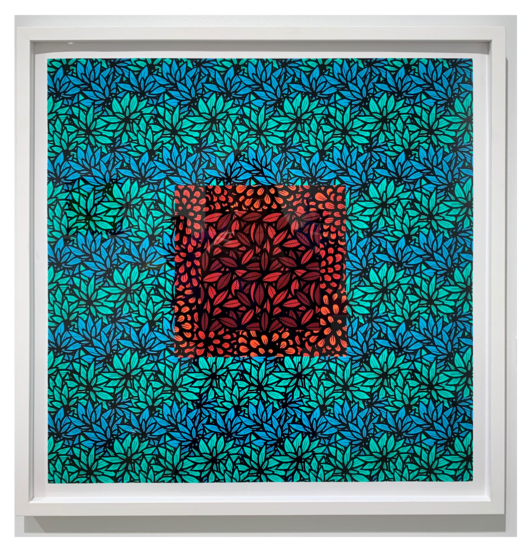
FLAG NO. 2, 2022 ARCHIVAL PIGMENT PRINT 26 X 26