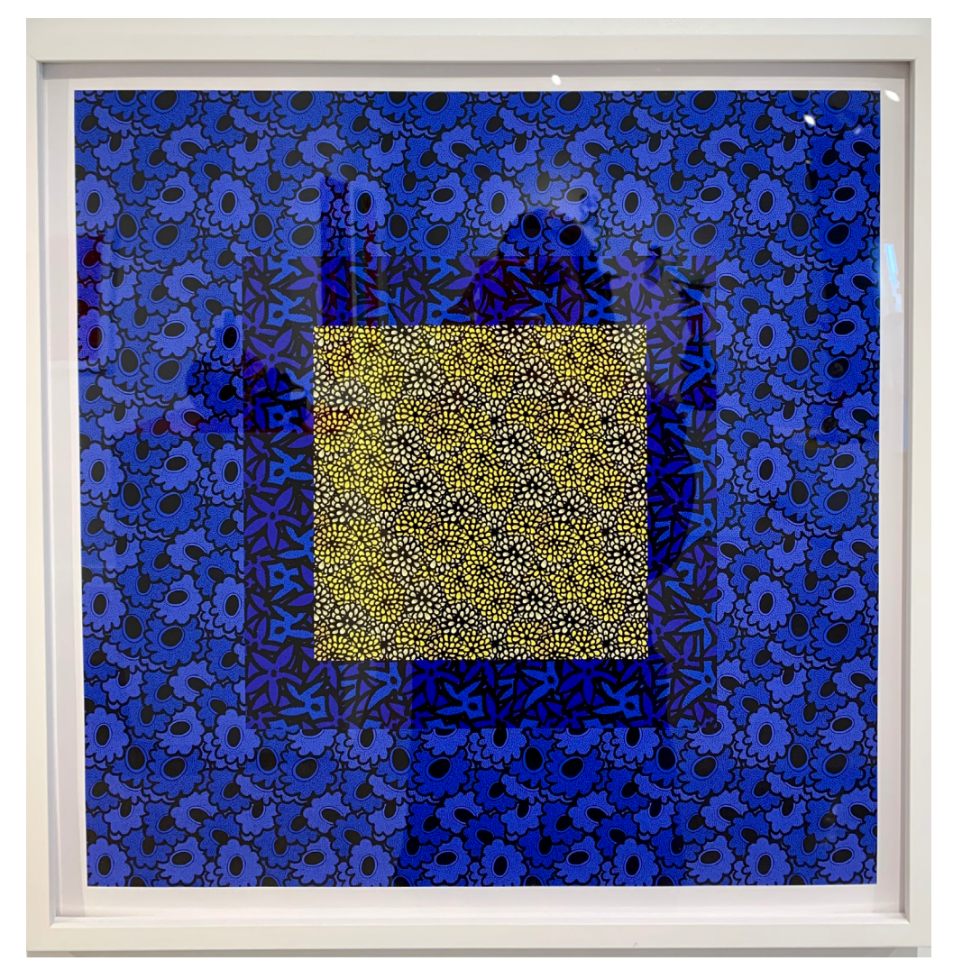
FLAG NO. 4 , 2022 ARCHIVAL PIGMENT PRINT 26 X 26